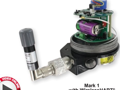
with WirelessHART® Model 1910D0