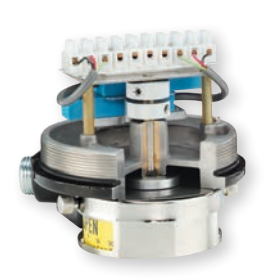
Mark 4 Thru-Shaft Cutaway Model 42RDOJ2

The Proximity™ MARK SERIES is a line of position indicators with a selection of various output options. Three model styles make up the Mark series to cover almost any application. Standard models in the Mark Series have visual position indicators any application. Standard models in the Mark Series have visual position indicators and are weatherproof, explosion-proof, and submersible. A large variety of outputs are available to fit specific applications. There is a choice of 1 to 6 switch outputs of 14 varieties including inductive sensors, high temperature switches, gold contact switches, hermetically sealed switches, and high current switches. Besides the switch outputs the Series offers potentiometer outputs, transmitters, HART® and WirelessHART® Communications. The units are purchased for either direct drive applications, such as rotary valves, or lever drive applications, such as linear valves. Adjustable visual indicator is standard on direct drive units that displays OPEN / CLOSED status and degrees.