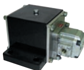
NHG 500 L