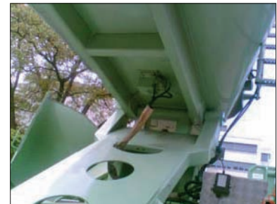
NHG 900 L