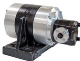
NHG 3000 L