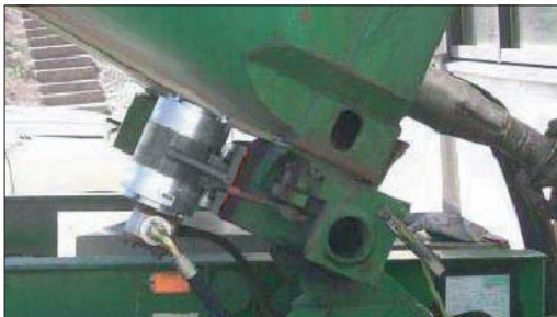
NHG 3000 L