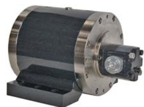
NHG 6000 L