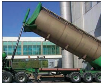
Emptying silo vehicles